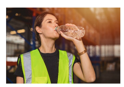
Tip: Drink up to 4 cups of water per hour on hot days.